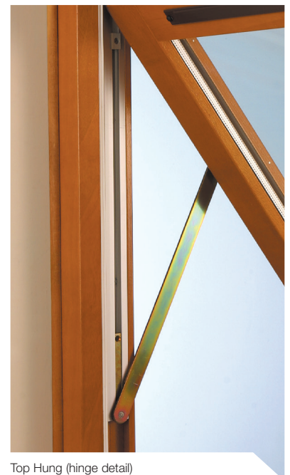
Top Hung (hinge detail)