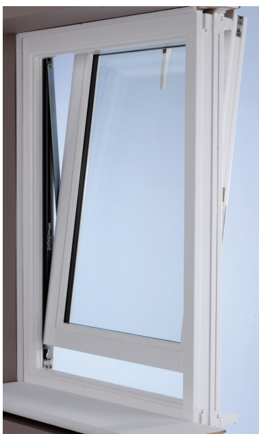
Top Swing fully reversed position