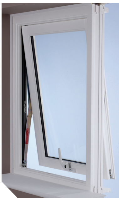
Top Swing first restriction point