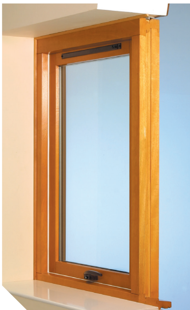
Top Hung (interior)