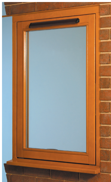
Top Hung (exterior)