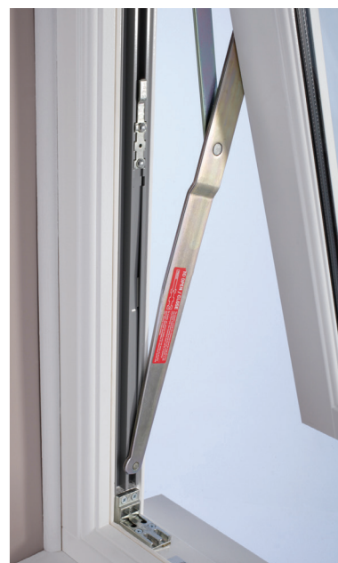
Top Swing restrictor second position