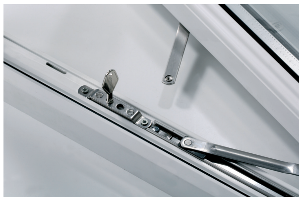
Key to detach