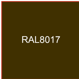
RAL8017 Brown Paint A dark brown semi-gloss finish.