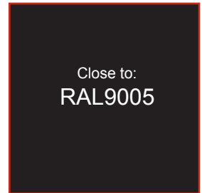
Close to: RAL9005 Black Paint A matt black finish.