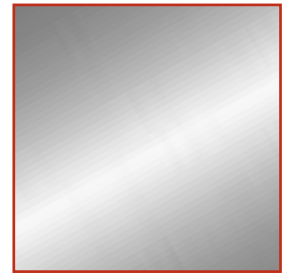
Satalyte/Satin Chrome A dull metal silver finish.