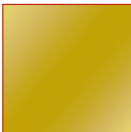
Gold Paint A semi-gloss gold, slight metallic, finish.