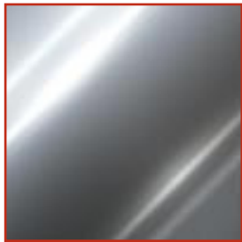
Bright Nickel A shiny silver plated finish.

Please note that this document is intended to give you a more detailed explanation of the finishes available on some of our metal products. The colour swatches included in this document, and those that are on TitonDirect, are intended to give you an indication of the final finish. It does not however guarantee that the finish will indentially represent that of the final product.