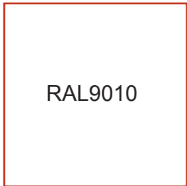
RAL9010 White Paint A plain white semi-gloss finish.