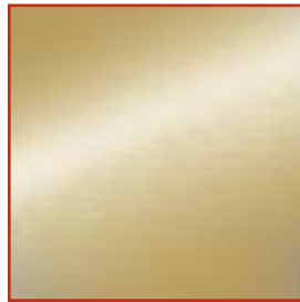
Albrafin Gold A shiny plated gold finish.