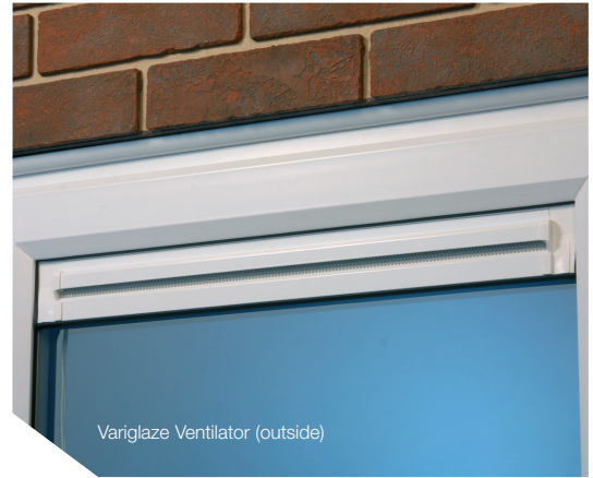
Variglaze Ventilator (outside)