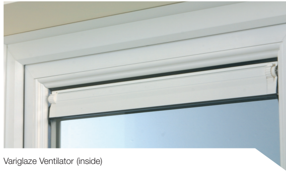
Variglaze Ventilator (inside)